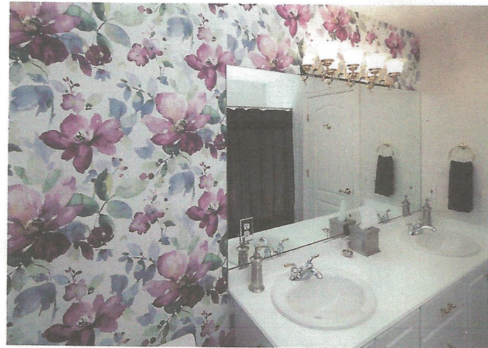
Opposite: This feng shui-inspired dining room features primary Fire and secondary Earth elements. Above left and right: The upstairs bedrooms are infused with Water and Metal, and Fire and Earth respectively; their shared bath (bottom right) uses Water, Metal, and Earth. Below right: The nursery crib faces the north wall in a room with Fire as its main element.

Two of the upstairs bedrooms—across the hall from each other in southeast and southwest positions—serve as guest rooms and share a bath. The east guest room has Metal and Water as its primary and secondary elements, so the walls are painted blue, and metal frames and lamp bases were incorporated to increase luck and health. By contrast, the west guest room's primary and secondary elements are Fire and Earth, so paintings with red hang on plum walls. "We loved the plum color," says Taylor, "because we had always intended to use that cream-colored tufted headboard in that room, and the plum color made that a perfect choice. The red in the paintings is really unexpected, but just looks great."