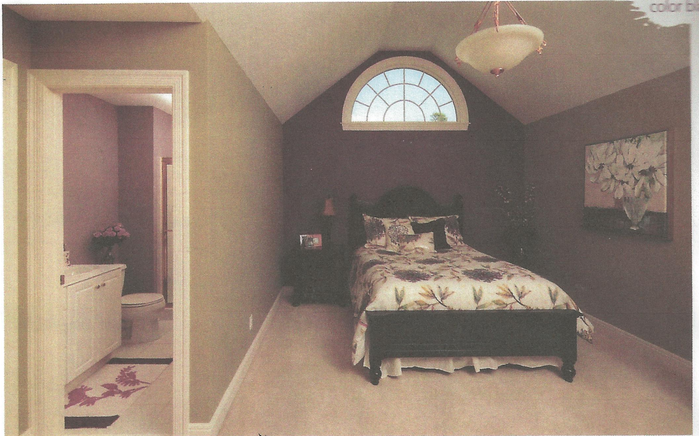
This room, which also called for Water, takes advantage of the element's soothing greens instead of blue.

As the holiday season approaches, fall into... the warmth of family and friends in your newly renovated kitchen