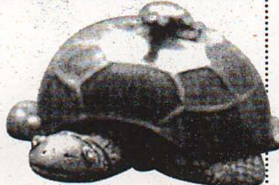
Turtles symbolize support and the Earth. They promote good karma